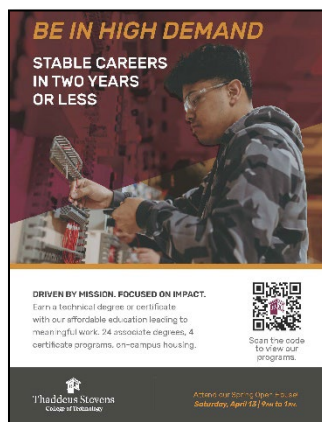
Full Page Color Ad