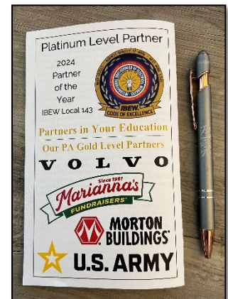
Pocket Program Back Cover