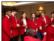
Schools and Business Booths